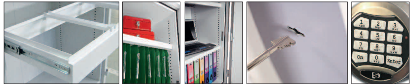
Optional Pull-Out Cradle

✚ Suitable for storage of controlled drugs whose active ingredients do not exceed 500 grams.