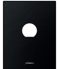
Titanium Black (B)