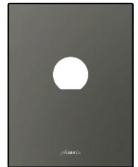
Metallic Silver (S)