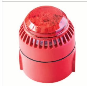
Siren and strobe light